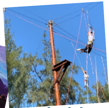
Aerial Adventure Courses