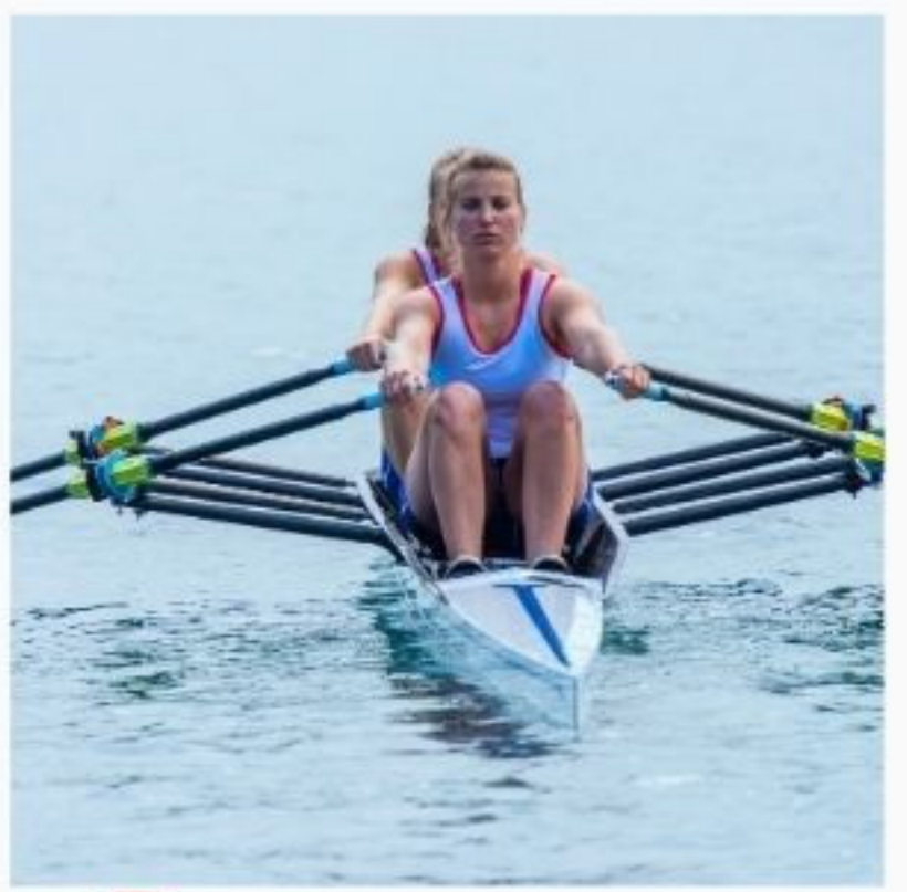
3 Rowing on the Seyhan Dam Lake,