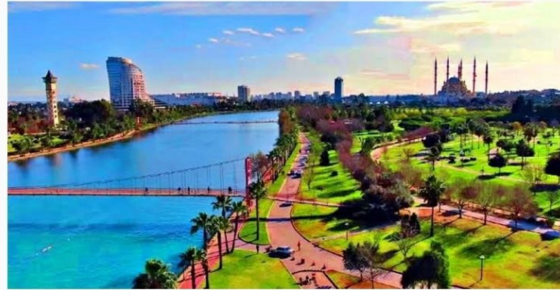
8 Exploring the historical places