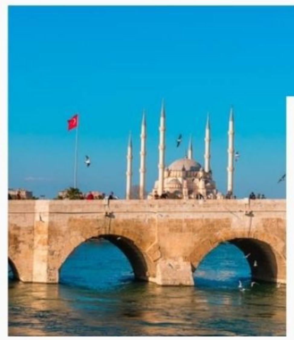
4 Stone Bridge (Taş Köprü)