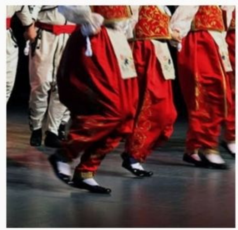
1 Learning traditional Turkish dances,

The first 6 days will take place in the picturesque Karadeniz Ereğli, followed by 6 unforgettable days in the culturally rich city of Adana.