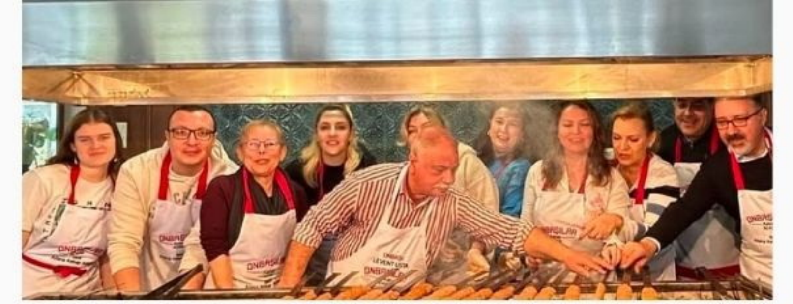
2 Savoring the world-renowned Adana kebab