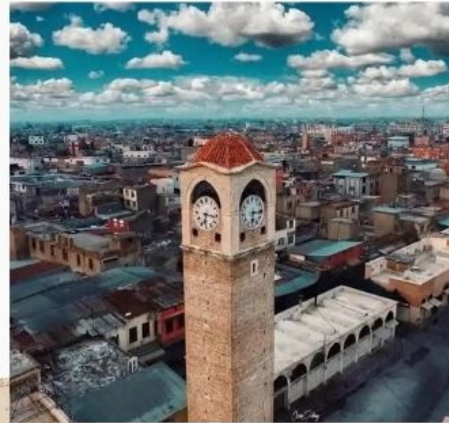
9 The Great Clock Tower (Büyük Saat),