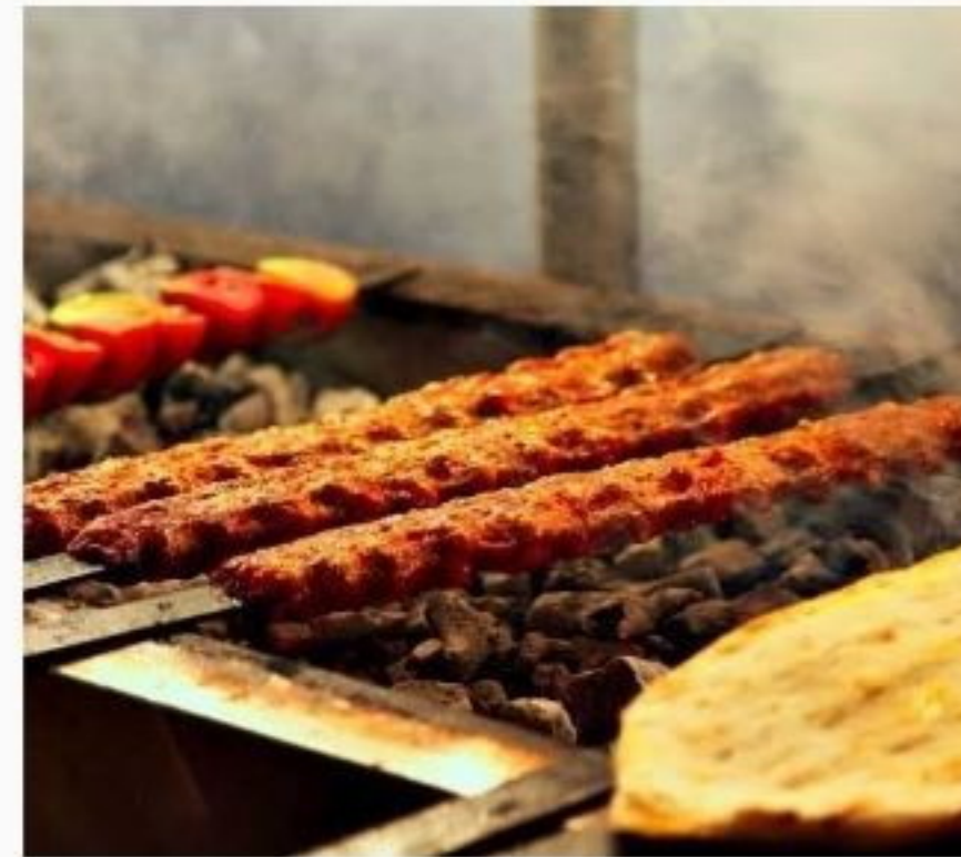
10 participating in an Adana Kebab Workshop to prepare our own kebabs,