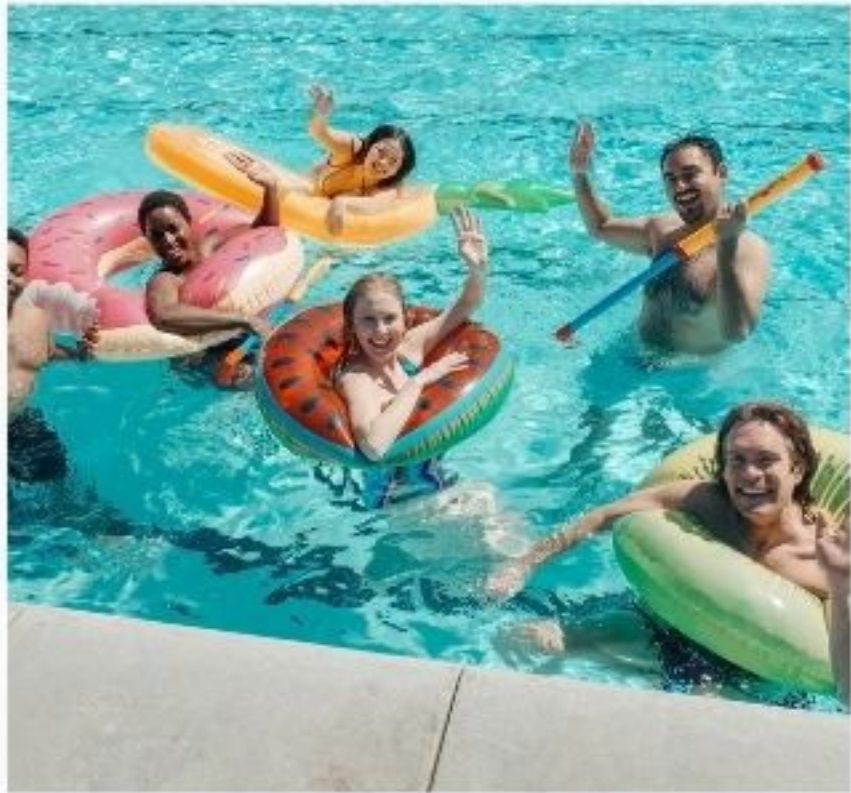
7 Swimming to fully enjoy the summer vibes!