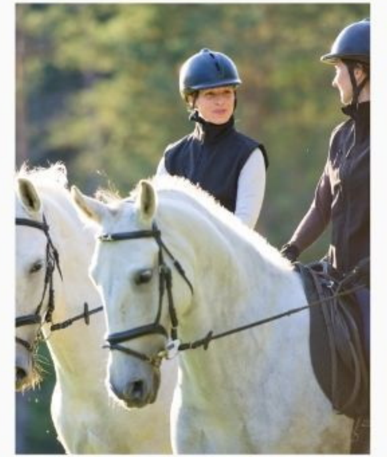
5 Enjoying the thrill of horseback riding,