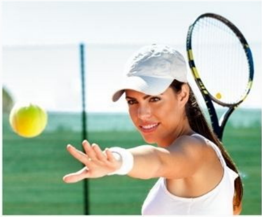
6 Playing tennis,