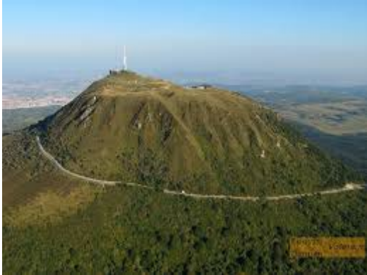
Visiting the Puy de Dôme Mountain Race competition